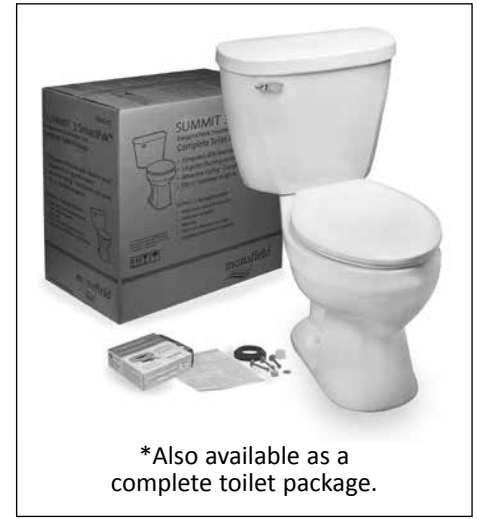
*Also available as a complete toilet package.